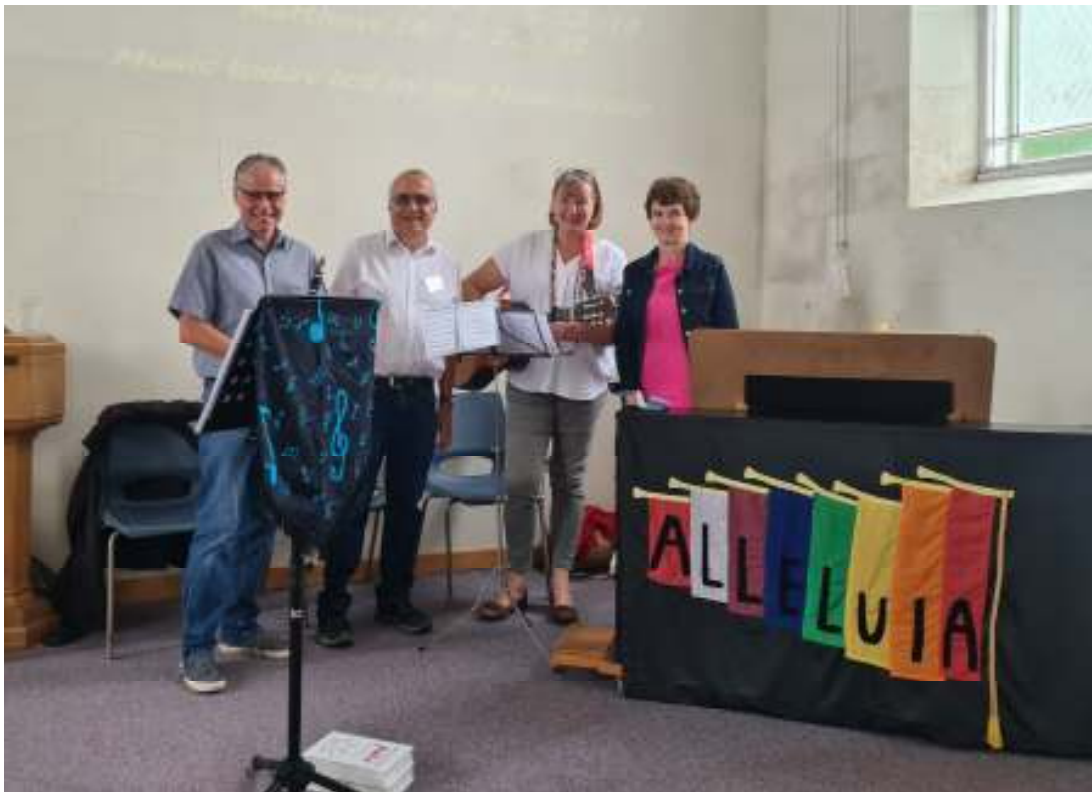
Part of our music group, see worship group article.