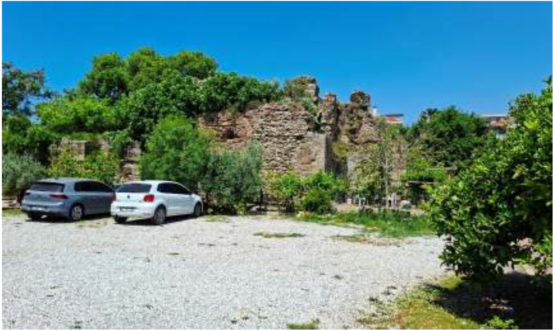
Possible Roman ruins, literally in the back garden of a local restaurant.