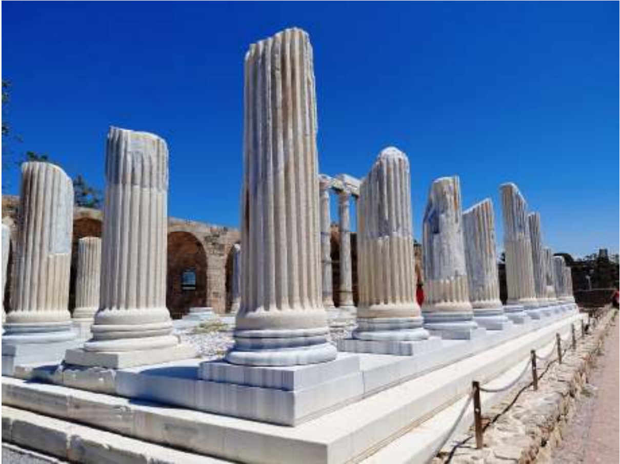
Side temple of Athena as restored.

But for me the centre piece was the partially restored temple of Athena, sited overlooking the harbour.