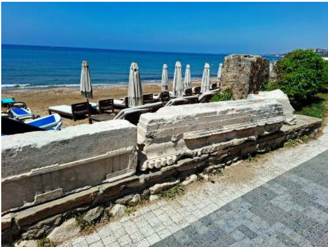
Pieces of carved white marble, probably from a temple architrave.

All of this brings us back to our strolls around the town. At every turn there is something of archaeological interest, either exquisitely carved pieces of marble propping up the sea wall, bits of columns or even large ruins popping up in someone's back yard.