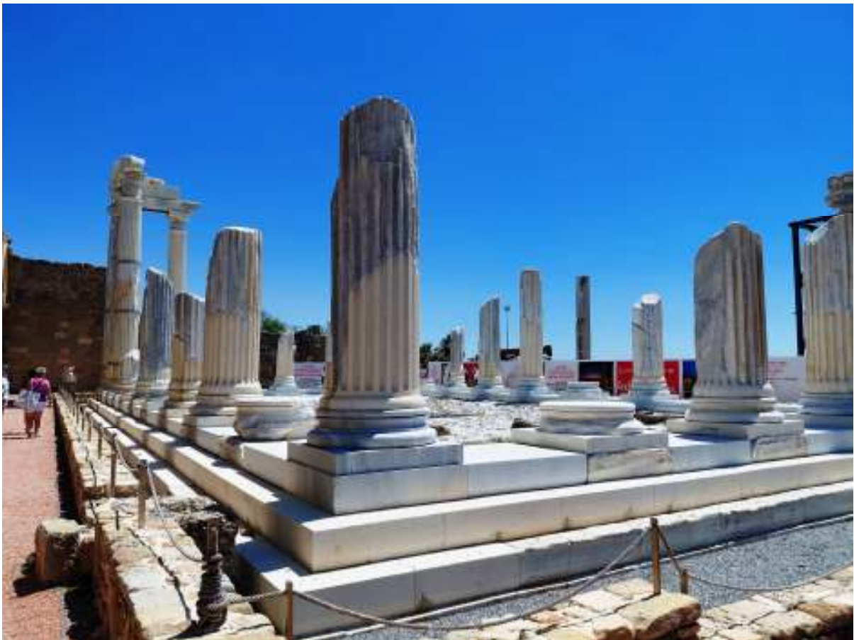
Temple of Athena, see postcard