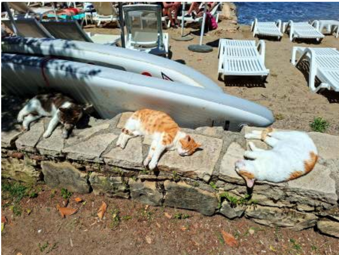
Oh yes! And cats everywhere.